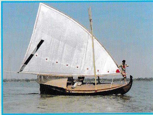
Win the World by Jute Boat